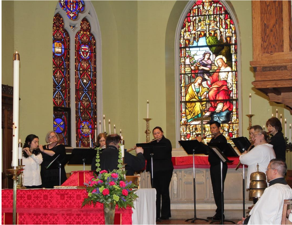
Flutiest Playing Prelude