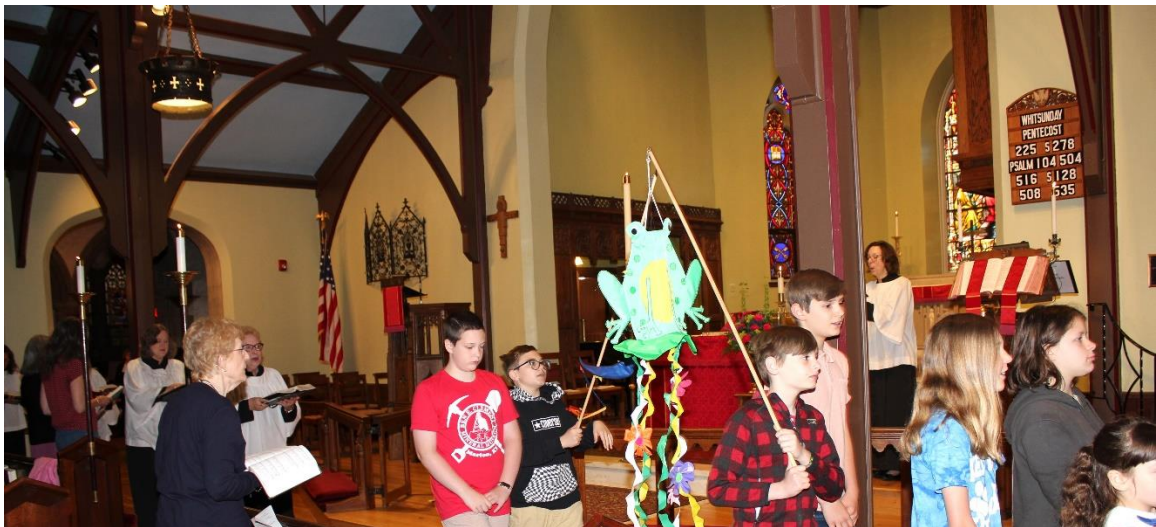
Procession of Religious Education Students