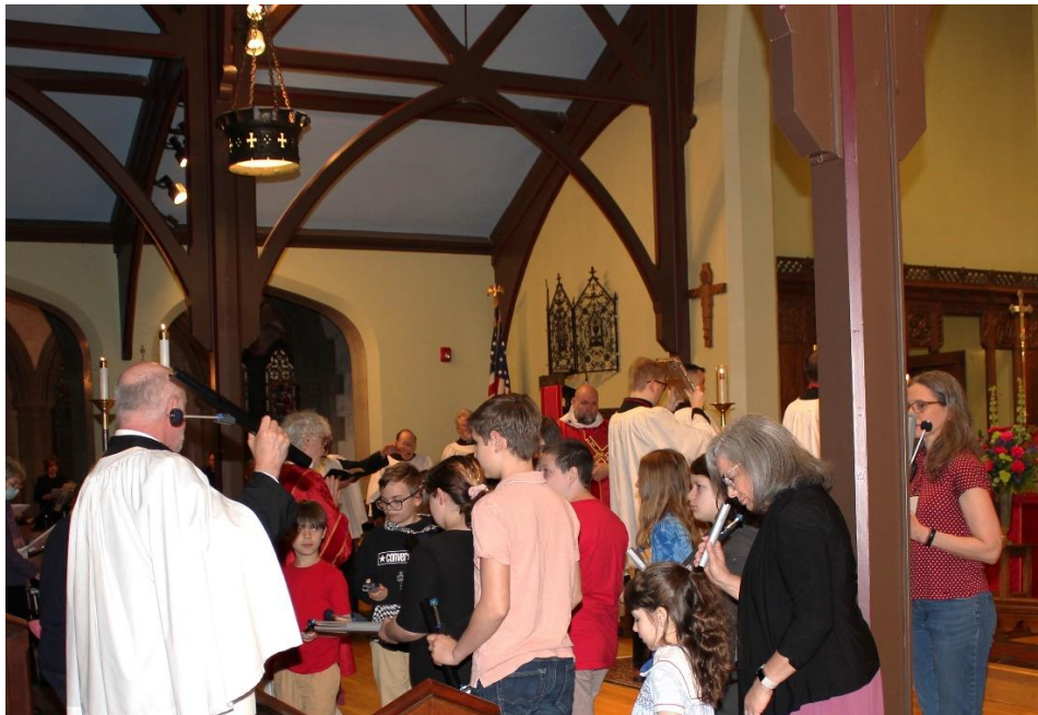
Religious Education Students Playing Chimes for Mass

O Lord Jesus Christ, who before ascending into heaven, promised to send the Holy Ghost to finish Your work in the souls of Your Apostles and Disciples, deign to grant the same Holy Spirit to me, that He may perfect in my soul the work of Your grace and Your love. Book of Common Prayer