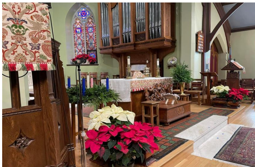
The work of our exemplary Altar Guild