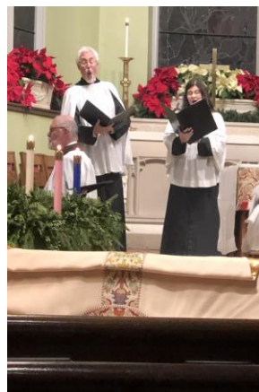
Lifting our hearts and our voices in song