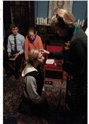
A member of the Episcopal Service Corps is marked with

The Episcopal Service Corps almost perfectly reflects my vision for the Church. It is a driver of self-reflection and integrity powered by the intimacy of its community. Where its members work in the world, they often provide physical sustenance, but they also help raise children who are deeply affected by empowerment and mentorship, a form of love many rarely receive.